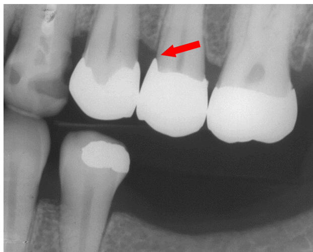
Figure 1. Interproximal radiography of biologic width invasion by overextending margin restoration.