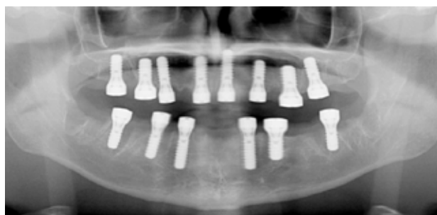
Figure 3. Post-surgical X-ray. All remaining teeth were extracted and 14 implants placed simultaneously with alveoplasty in the maxillary and mandibular ridges.

vertical dimension OVD ( Figure 2 ). Consultations were obtained from Orthodontics and Oral and Maxillofacial Surgery Departments. Orthodontic treatment was not indicated, and based on the prosthodontist's and surgeon's consultations, it was agreed that extracting all non-restorable primary teeth, permanent central incisors and molars was indicated, to be replaced with implant-supported fixed restorations. Eleven retained primary teeth were identified with severe wear and submerged relative to the permanent teeth.