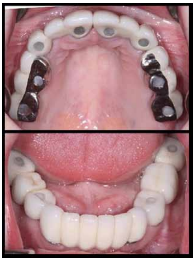
Figure 8. Screw-retained fixed partial dentures were torqued based on the manufacturers' recommendations.