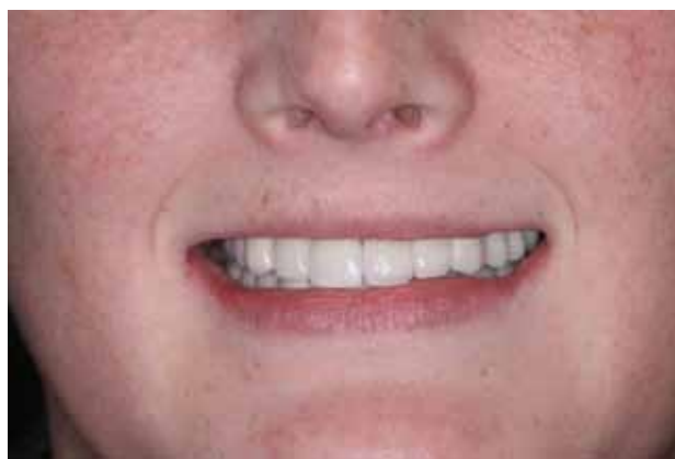
Figure 9. The patient was satisfied with the function and the esthetic outcomes.