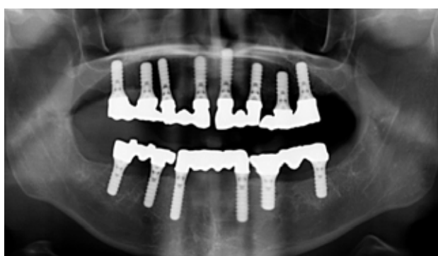
Figure 5. Metal try-in performed for 7 screw-retained fixed partial denture prostheses. Panoramic X-ray six months after implant placement.

Six months after the surgical procedure, clinical and radiographic examinations confirmed the osseointegration of all 14 implants. This observation was reported for patients with ED who received dental implants (Davarpanah et al. , 1997; Guckes et al. , 1997; Rad et al. , 2007). synOcta® impression copings were used for implant level polyvinyl siloxane (PVS) (Monophase, Dentsply, PA) impression material using the closed tray technique for maxillary and mandibular implants (Figure 4). The impressions were poured in type IV die stone (UltiRock, Whip Mix, Louisville, KY). Occlusion was established using record bases and wax rims as for edentulous cases initially. Facebow (Whip Mix Corporation, Louisville, KY) and centric relation were recorded with a vinyl polysiloxane bite registration material (Blu-Mousse® VPS Bite Registration Material, Patterson Dental, Louisville, KY). Casts were mounted on a semiadjustable articulator (Whip Mix Model 2340 Articulator, Whip Mix Corporation, Louisville, KY). Straumann synOcta® 1.5 mm screw-retained abutments were used to fabricate screw-retained fixed partial denture prostheses (FPDP) for ease of retrievability (3-5, 6-8, 9-11, 12-14, 18-21, 22-27, 29-31 FPDP). Clinically, a metal try-in was performed for the screw-retained fixed partial denture prosthesis to ensure passive fitness with metal vertical stops