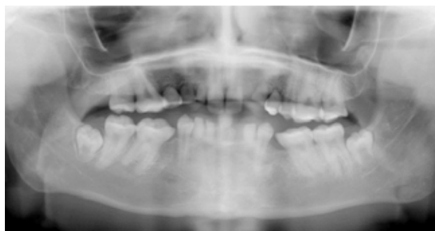
Figure 1. Preoperative panoramic X-ray.

Comprehensive clinical and radiographic examination reported multiple missing teeth, ankylosed worn primary teeth ( Figure 1 ), permanent central incisors and first molars in the upper arch, permanent canines and molars in the lower arch, and deep overbite occlusion with minimal inter-arch space with loss of occlusal