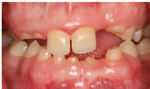
Figure 2. Preoperative clinical picture shows hypodontia, ankylosed retained primary teeth and minimal inter-arch space with loss of occlusal vertical dimension.